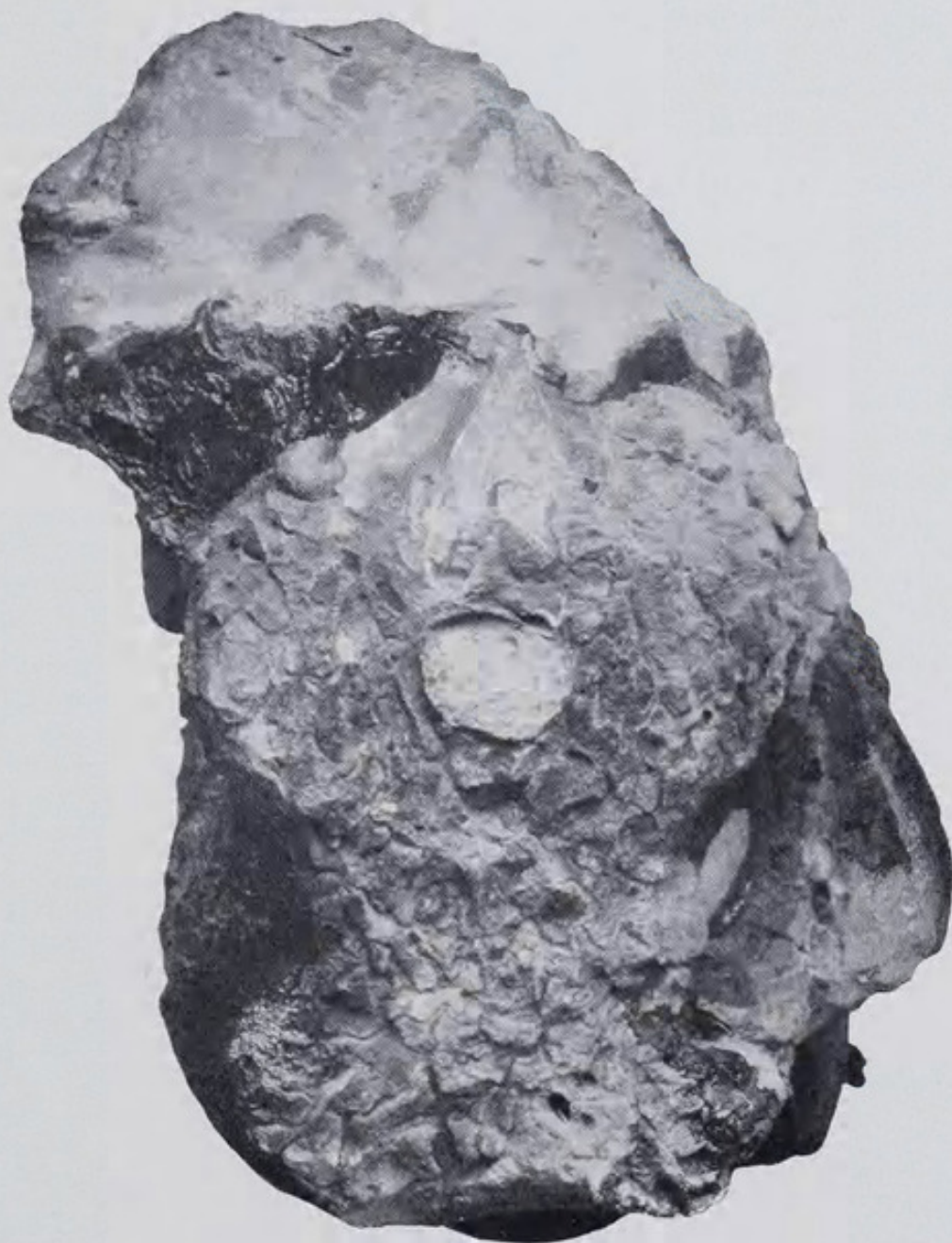
Austrosaurus mckillopi . Posterior view of Specimen A, showing transverse fracture of centrum and intramural complex of cavities.