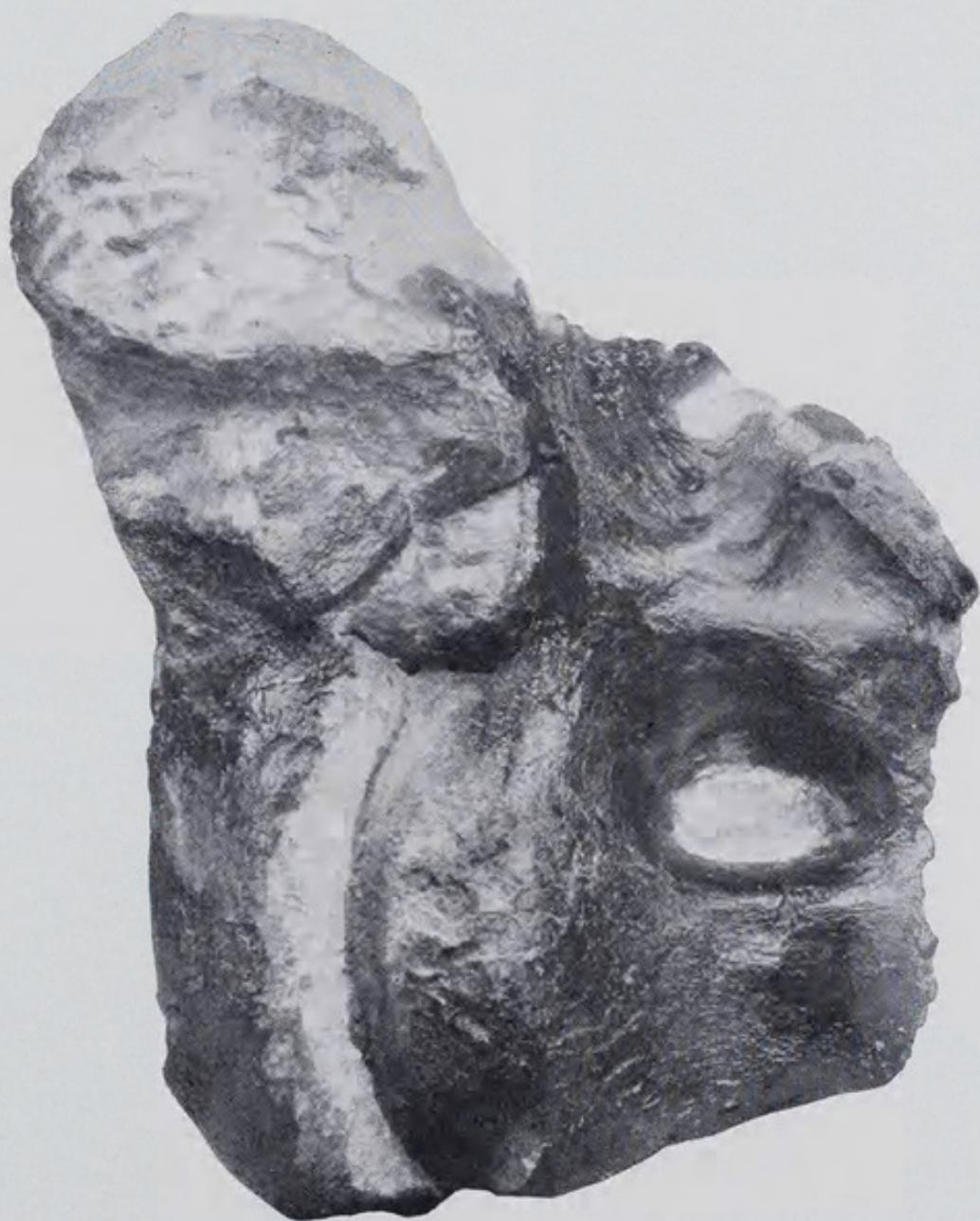
Austrosaurus mckillopi . Lateral view of Specimen A—incomplete dorsal vertebræ (Holotype).