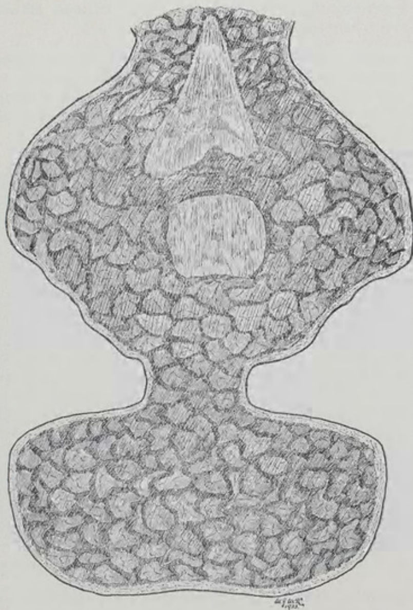
Text-figure 3.—Section of vertebra of Austrosaurus mckillopi taken at the maximum extent of the pleurocoels, showing also the recess in the neural arch. The complex of intramural cavities is shown somewhat diagrammatically. (One-half natural size.) Del. M. J. McKillop.

The type centrum of " Bothriospondylus magnus " as figured by Owen, which is also the type of Seeley's Ornithopsis , shows the same characteristics. 1 Seeley's and Owen's genera are now usually included in the synonymy of Mantell's