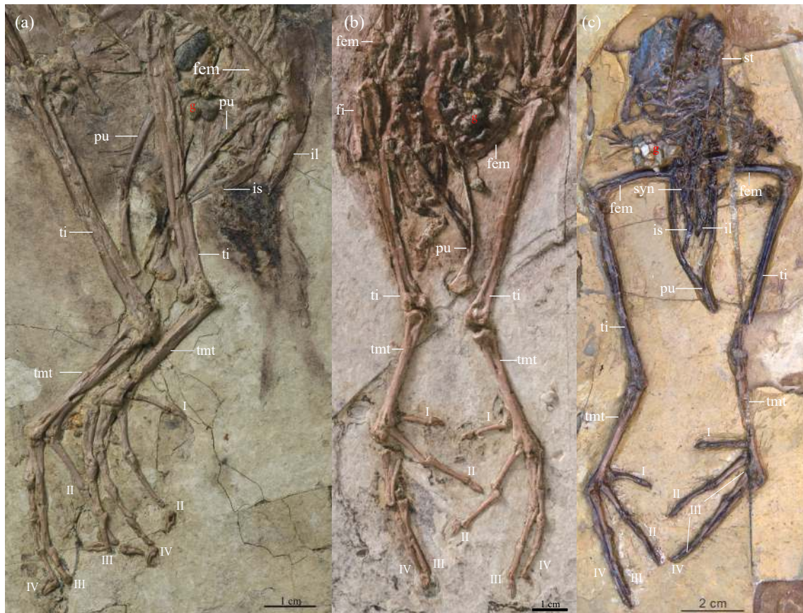
Fig. 4. Photograph of the hindlimbs and pelvic girdles of Iteravis huchzermeyeri IVPP V18958 (a), Gansus zheni BMNHC-Ph 1342 (b) and Gansus yumenensis (c). il—ilium; pu—pubis; is—ischium; fem—femur; ti—tibiotarsus; tmt—tarsometatarsus; I—pedal digit I; II—pedal digit II; III—pedal digit III; IV—pedal digit IV; st—sternum; syn—synsacrum; g—gastroliths.