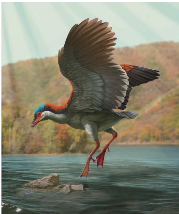
Fig. 5. Life scene of Iteravis huchzermeyeri (drawn by Chuang Zhao).

completely exposed and it was nearly equal to pedal digit II-2, which is the same as the condition in BMNHC-Ph1342.