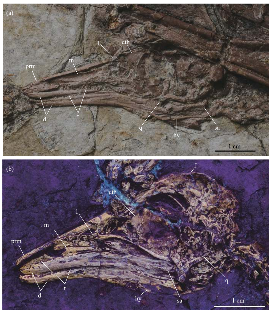
Fig. 1. Photograph of the skull of Iteravis huchzermeyeri IVPP V18958 (a) (under normal light) and Gansus zheni BMNHC-Ph 1318 (b) (under UV lamp). prm—premaxilla; m—maxilla; d—dentary; t—teeth; hy—hyoid; l—lacrima; eth—ethmoid; sa—surangular; q—quadrate; f—frontal.

The sternum of BMNHC-Ph1342 is craniocaudally elongate, nearly twice of its width, with a deep keel extending through the middle section, and the rostral margin forming an angle of less than 90° (Fig. 2b), which is the same as that of IVPP V18958 (Fig. 2a) but different from that of G. yumenensis (140°) (Fig. 2d). The caudal margin of the sternum of BMNHC-Ph1342 is covered by gastroliths and other bones, which prevents establishing the exact morphology.