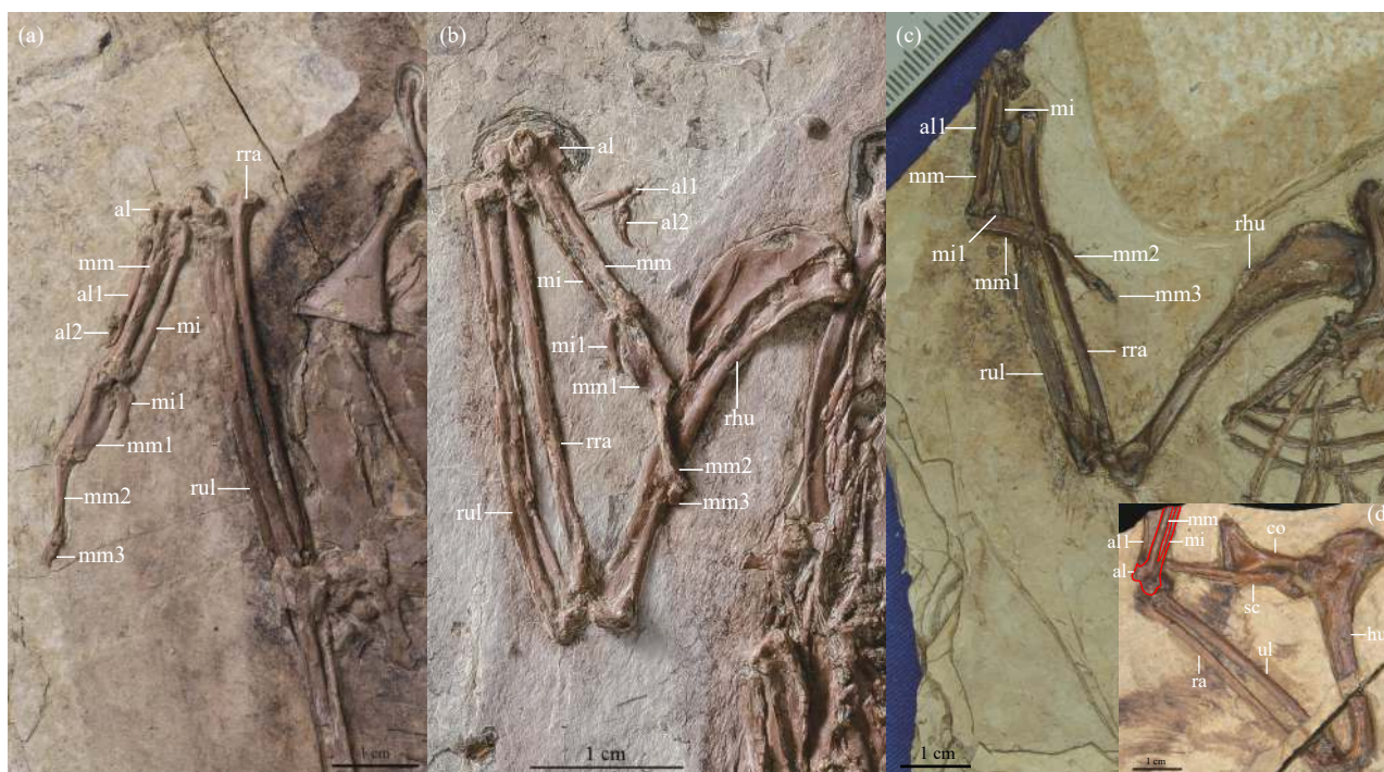
Fig. 3. Photograph of the forelimbs of Iteravis huchzermeyeri IVPP V18958 (a), Gansus zheni BMNHC-Ph1342 (b) and Gansus yumenensis (c) (d). rhu—right humerus; hu—humerus; rul—right ulna; ul—ulna; rra—right radius; ra—radius; al—alular metacarpal; mm—major metacarpal; mi—minor metacarpal; al1/2—alular digit 1/2; mm1/3—major digit 1/3; mi1—minor digit 1; co—coracoid; sc—scapula.

The pedal phalangeal formula is 2-3-4-5-x in IVPP V18958 and BMNHC-Ph1342 (Zhou S et al., 2014; Liu D et al., 2014). However, there are some differences between them. In IVPP V18958, pedal digit IV is as robust as digit III and slightly shorter than digit III, and all unguis phalanges bear a pronounced flexor process (Fig. 4a) (Zhou S et al., 2014). In BMNHC-Ph1342, pedal digit IV is prominently slender and slightly longer than digit III, and all unguis phalanges lack a pronounced flexor process (Fig. 4b). The pedal digit II-2 of IVPP V18958 is longer than digit II-1 (Zhou S et al., 2014). Actually, they are nearly the same length as the condition in BMNHC-Ph1342. In G. yumenensis , pedal digit IV is much longer than digit III (Fig. 4c),