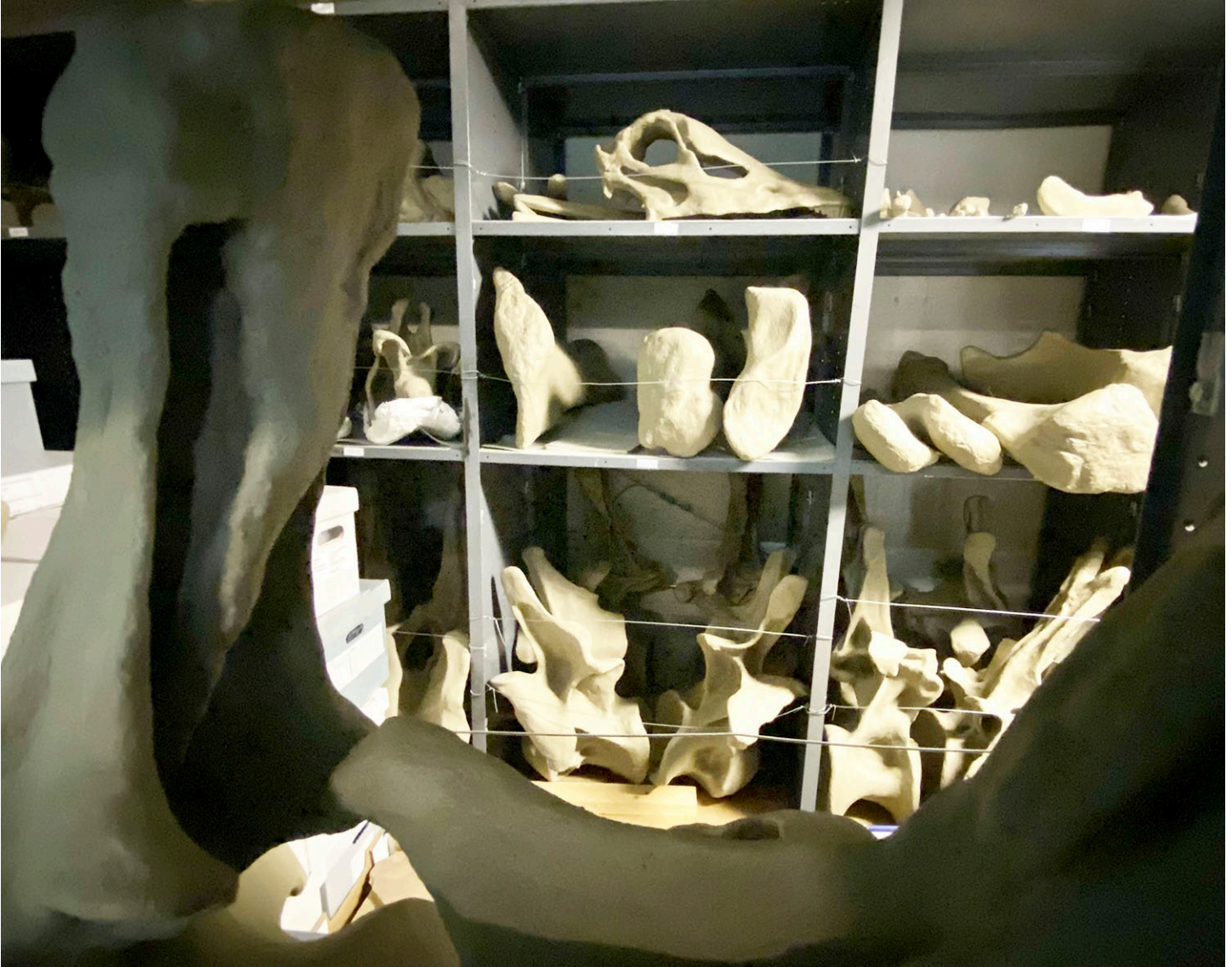
Figure 13. The elements of the concrete cast as they are now, having been cleaned and stored in the basement storage area on the Utah State University Eastern campus in Price, Utah.

Even the Diplodocus that started it all, the cast presented by Andrew Carnegie to the British Museum (Natural History) on May 12, 1905, seems to be ambling towards an undistinguished fate. Having been the centerpiece of the museum's main hall for nearly four decades, it was removed in 2017 to make more space for corporate events (Steerpike, 2015; Nieuwland, 2019, p. 260). The cast was sent on a tour of the UK, but now that this has concluded, "in all likelihood the plaster dinosaur will meet an inglorious end in the basement of the museum" (Nieuwland, 2019, p. 4). However, while