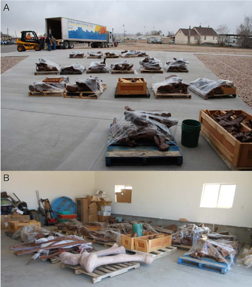
Figure 11. The elements of the concrete cast moving from Vernal to Price, Utah, on April 8, 2013. (A) The concrete cast packed onto wooden pallets outside the new Field House building, having been prepared for transportation to the Utah State University Eastern campus in Price, about 100 miles southwest of Vernal. (B) The same bones having been unpacked into Ken Carpenter's garage in Price, Utah.

cause that is where the city holds outdoor events, and no room on the north side because of the parking lot and overhead main power line for downtown businesses. The intention was that the cast would be mounted outside a new museum in Price, which was then in the planning and fund-raising stage. However, due to funding difficulties this museum was never built and the land that had been donated for the museum was returned to the donor. In light of these developments, Carpenter discussed with the USU chancellor the possibility of temporarily mounting the skeleton on campus. However, this idea was not implemented since Carpenter feared that mounting and later dismantling the cast to move it to a new museum would damage it. Therefore,