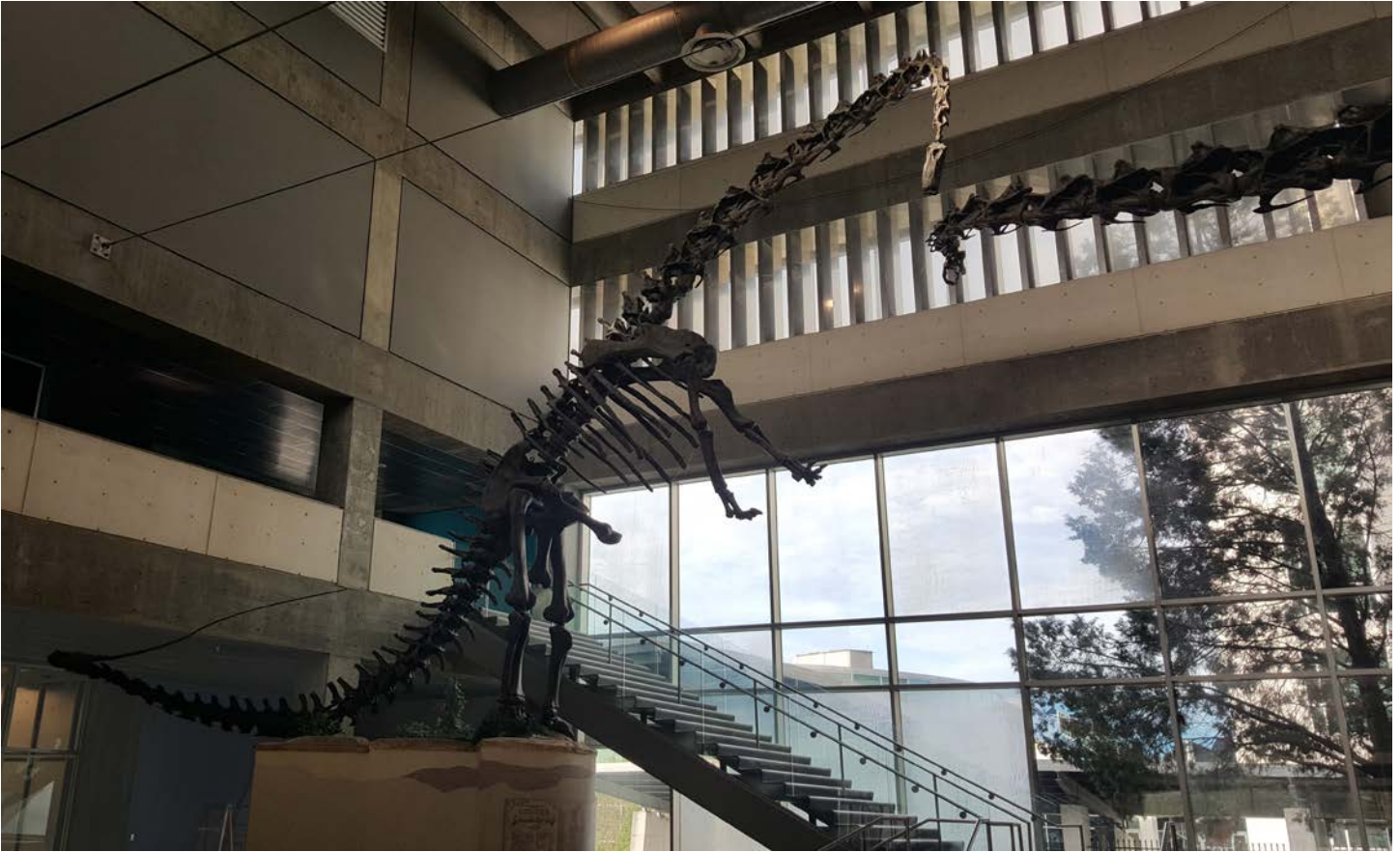
Figure 10. Double Diplodocus mount at the Museum of Science and Industry (MOSI), Tampa, Florida. Both individuals are identical, having been cast from the molds made by Dinolab from the concrete Diplodocus of Vernal.

gested posting a news article requesting the return of the bones, and the workman came forward with them enabling the femora to be reunited with the rest of the concrete skeleton.