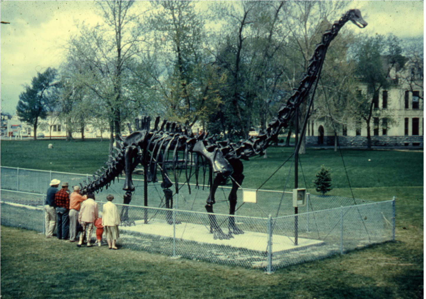
Figure 5. The completed outdoor Diplodocus mount in a rare color photograph (undated).

ed that casting “will start soon” (Anonymous, 1960d), but evidently that work was significantly delayed as nearly a year later on June 11, 1961, the museum reported that “work will begin here Monday on a replica of a pre-historic dinosaur that will eventually tower 21 feet in Sunset Park [...] the project will consume many months before the animal will be erected on a frame in the park” (Anonymous, 1961a). Already by this point the disorganization and physical state of molds was of concern as “Several months will be involved classifying and preparing molds for casting” (Anonymous, 1961a).